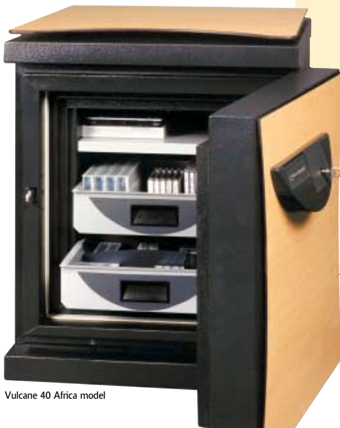
Vulcane 40 Africa model

The VULCANE safe has been subjected to the most stringent tests in the market, recreating the actual conditions of a serious accident. The VULCANE safe has also been tested in a fire situation simulating three storeys of floorboards giving way. It has also proved effective in safeguar- ding data against dampness, dust and magnetic fields.