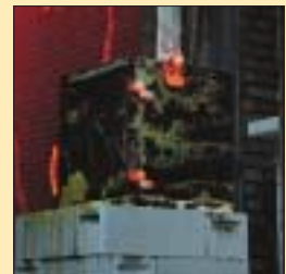
Out of the furnace