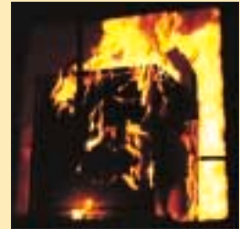
In the furnace