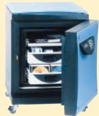
Vulcane 40 Arctic model

At 55°C any data recorded on a magnetic data carrier, such as a diskette or a Zip disk, is irremediably lost. Yet during a fire, temperatures may easily reach 1200°C.